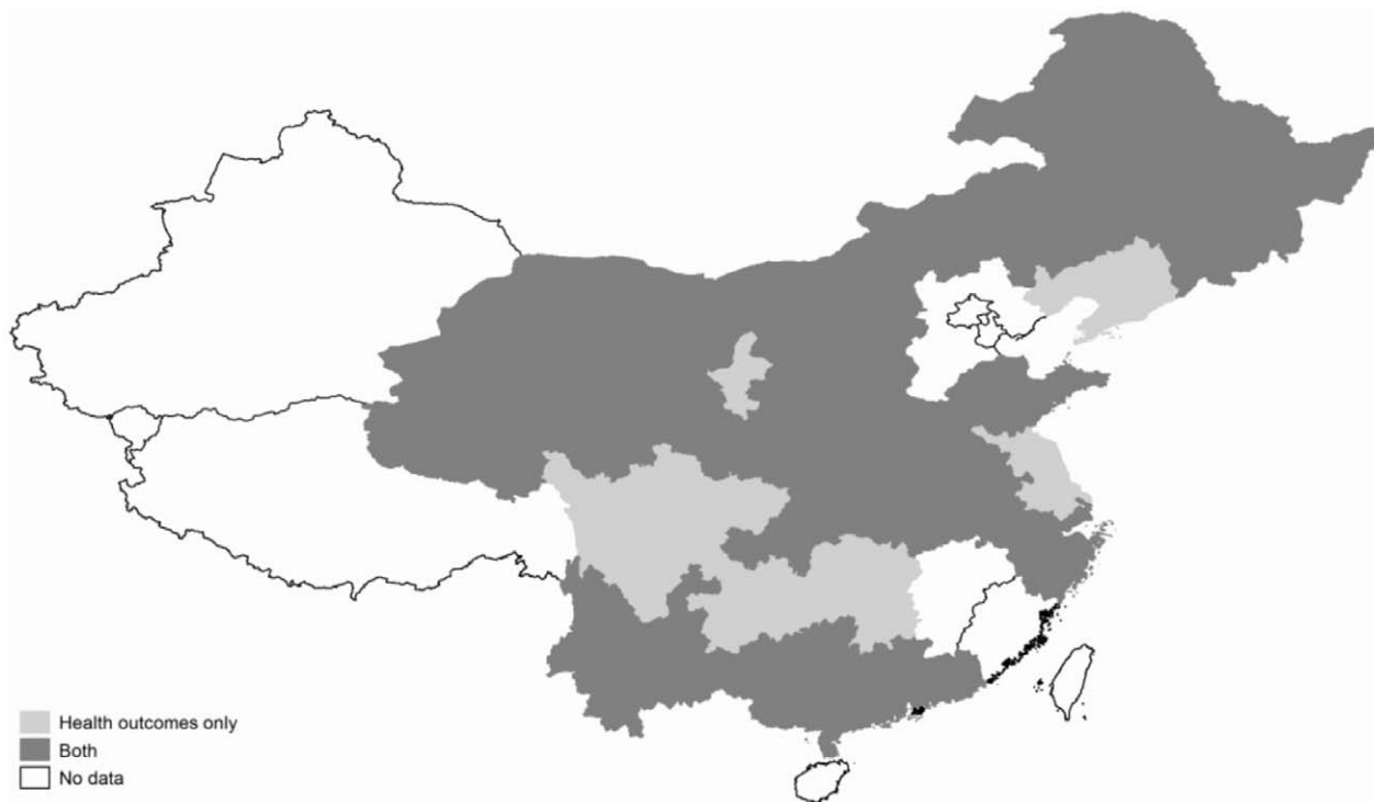
Figure 2. Study site of the 15 studies. doi:10.1371/journal.pone.0040850.g002

Of the five studies examining the effect of NCMS on self-reported health, scaled as “very good”, “good”, “fair”, “poor” and “very poor”, three panel studies used the DD method and/or PSM estimation and showed no improvement or very limited improvement ( P < 0.1 ) of self-reported health after NCMS [8,25,36]. In addition, two cross-sectional studies without controlling any confounding factors showed no effect or worse health outcome (73.2% of the NCMS members and 74.7% of controls were assessed “very good” or “good” by themselves) [31,33].